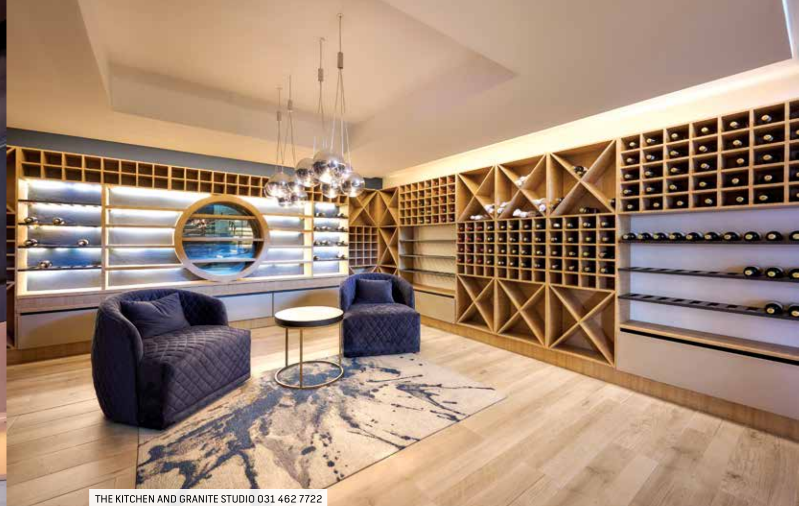
THE KITCHEN AND GRANITE STUDIO 031 462 7722

ABOVE: For this home, the owner wanted an elegant design for the wine cellar. The brief required beautiful details, such as the seated tasting area in the centre of the room. It was important that the design complemented the rest of the home. The Kitchen and Granite Studio materialised this exquisite space, which features sawn oak veneer with a Rehau German acrylic accent colour on the cabinetry and matt black floating wine racks in solid oak with an open grain finish.